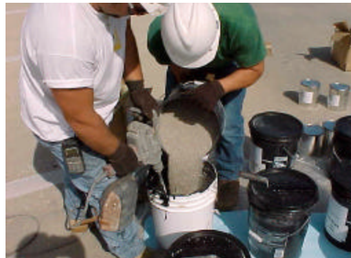
11. Add & mix in aggregate material.