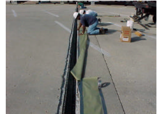
3. Mask off and protect work area.