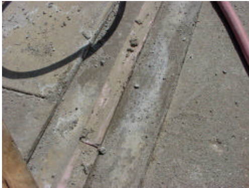
1. Prepare dry & sound blockout.