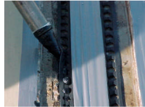
9. Gun tack coat material under wing.