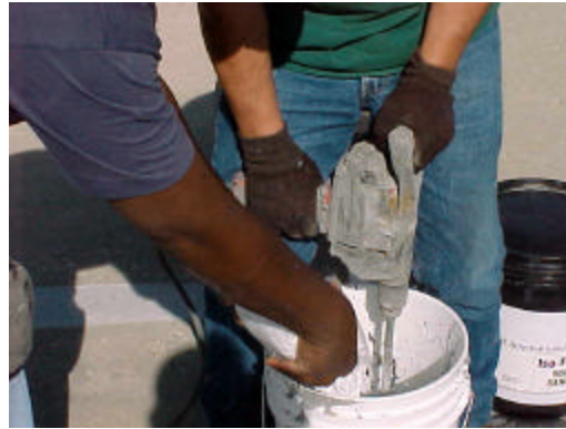
8. Mix components for 1 minute.