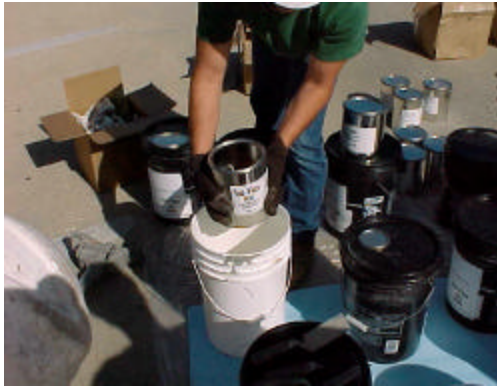
7. Combine tack coat liquid components.