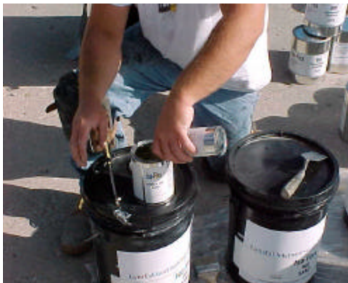
4. Mix two Primer #10 components.