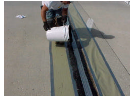
12. Pour 900 header into blockout.