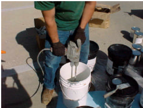
10. Combine 900 header liquids.