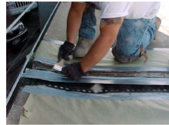
6. Ensure that primer is under profile wings.