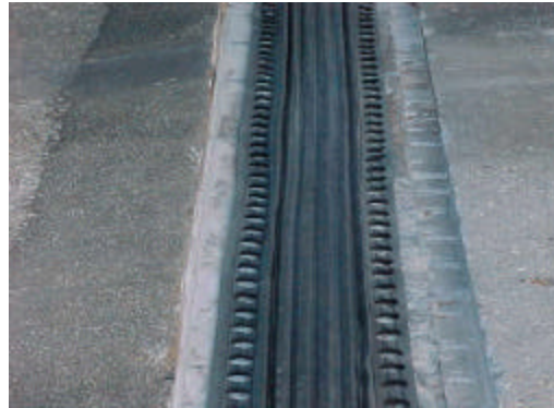
2. Install joint profile with wings flush.