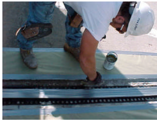
5. Brush apply primer to concrete interfaces.