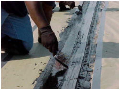
13. Trowel header to a smooth finish.