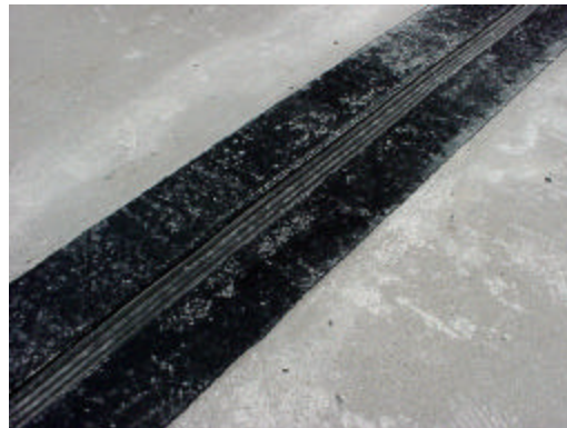
14. Completed installation.